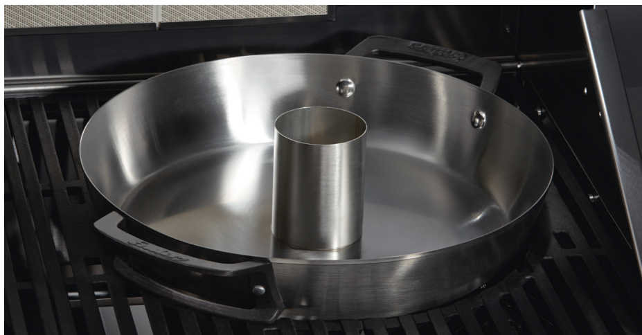
SWITCH GRID POULTRY ROASTER