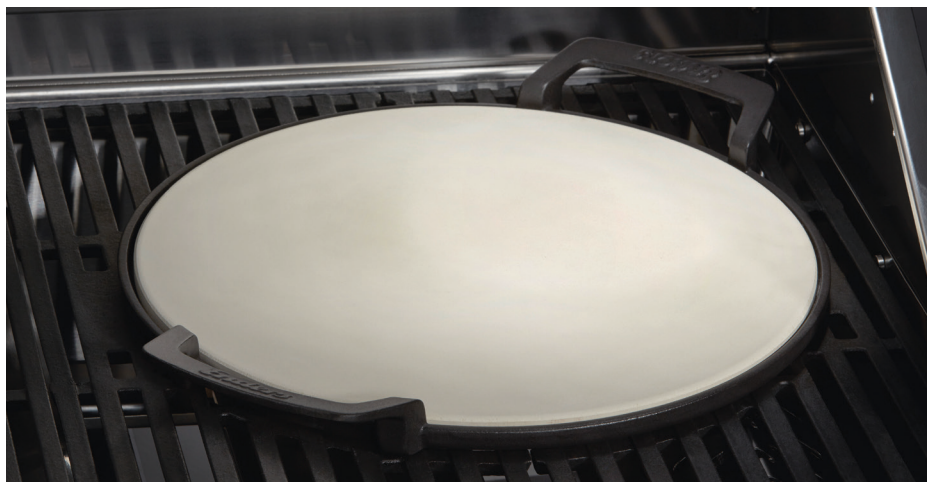
SWITCH GRID PIZZA STONE