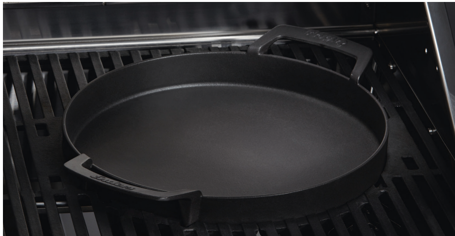
SWITCH GRID PAN