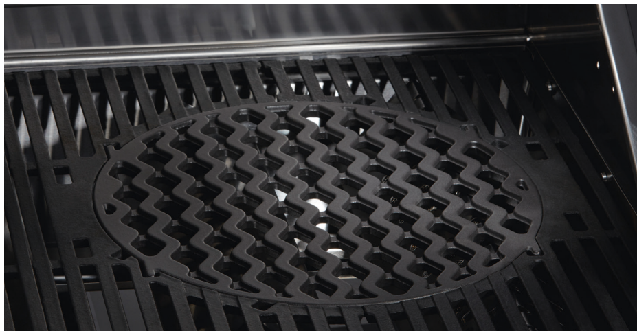
SWITCH GRID SEAR GRATE